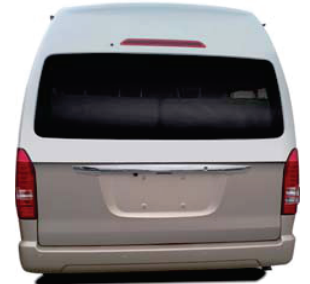
High-mount brake lamp

The H200 bus belongs to the latest generation model with the upgraded features including ABS+EBD, Plasma air cleaner, Power steering, Energy-absorbing steering system, Front & rear A/C, Immobilizer, etc. It is designed to offer the delicate comfort for whom travel with it.