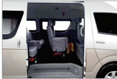
Heightened & widened sliding door