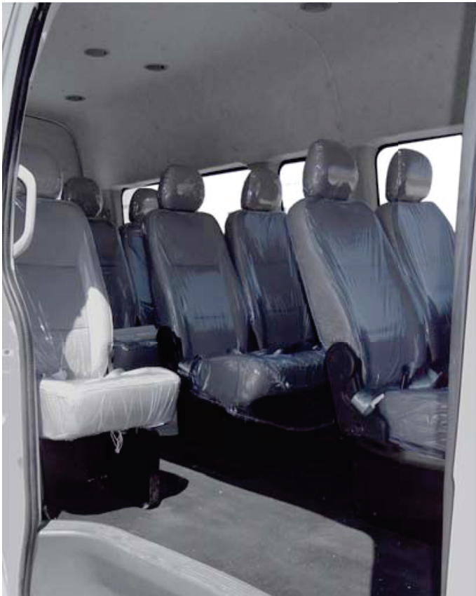
Standard Fabric Seats