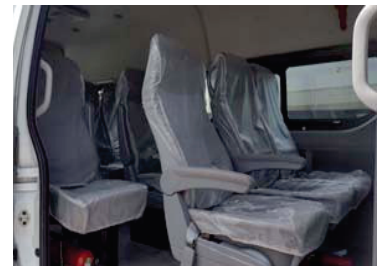
Front & rear A/C, Plasma air cleaner