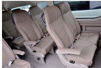
Leather Aero Seats (Option)