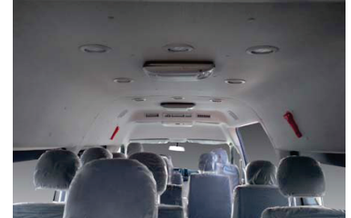
Fabric Aero seats (option)