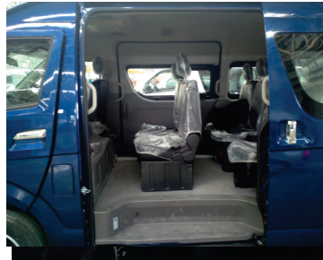
Space for Comfort